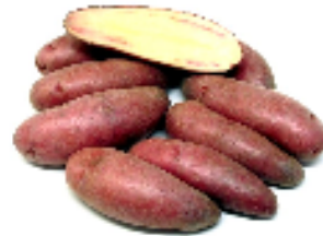
The Red Rebel