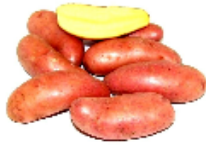
The Rocky Rose